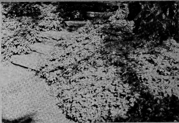
A neat small Pachysandra planting in partially shaded area. About 200 plants used on both sides of steps. Myrtle, requiring about 150 plants, will also do well under these same conditions.

Special: 300 plants, $20.85. Enough to cover 75 sq. feet. An area about 22 feet long and 3½ feet wide.